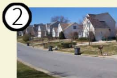
average street and street drains