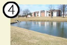
standard common area