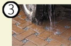
pervious pavers on driveway