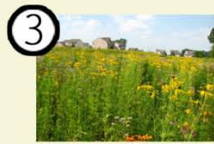
native planting in common area