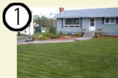
turf grass landscape