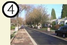
permeable pavement trench in street or on sidewalks