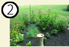
native planting areas and rain gardens