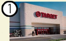
1 commercial retail buildings