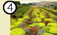
4 green roof