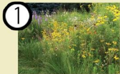
1 natives in common area