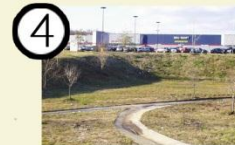
4 adjacent common wet detention/pond area