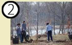
2 tree plantings