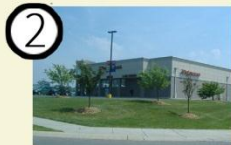
2 turf grass landscape