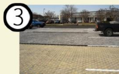
3 pervious pavers