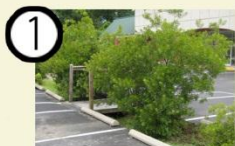
1 bioretention parking islands