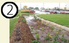
2 bioretention in drain- age swale