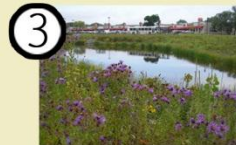
3 riparian buffer on adjacent retention pond/ stream