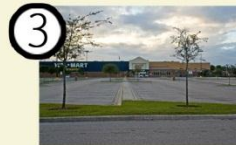
3 average parking lots, streets & street drains