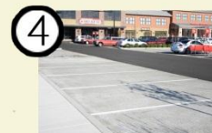
4 permeable pavement (porous concrete)